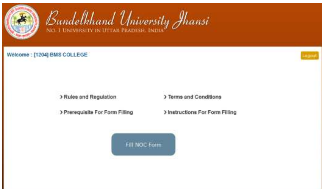
Image: Home Page of NOC