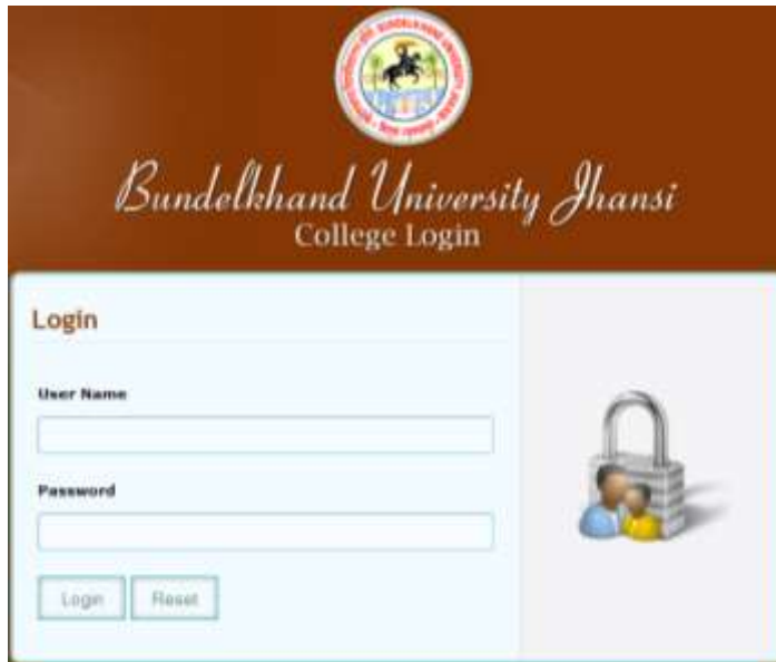
Image: College Login Form